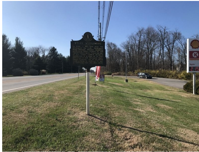
November 28, 2020